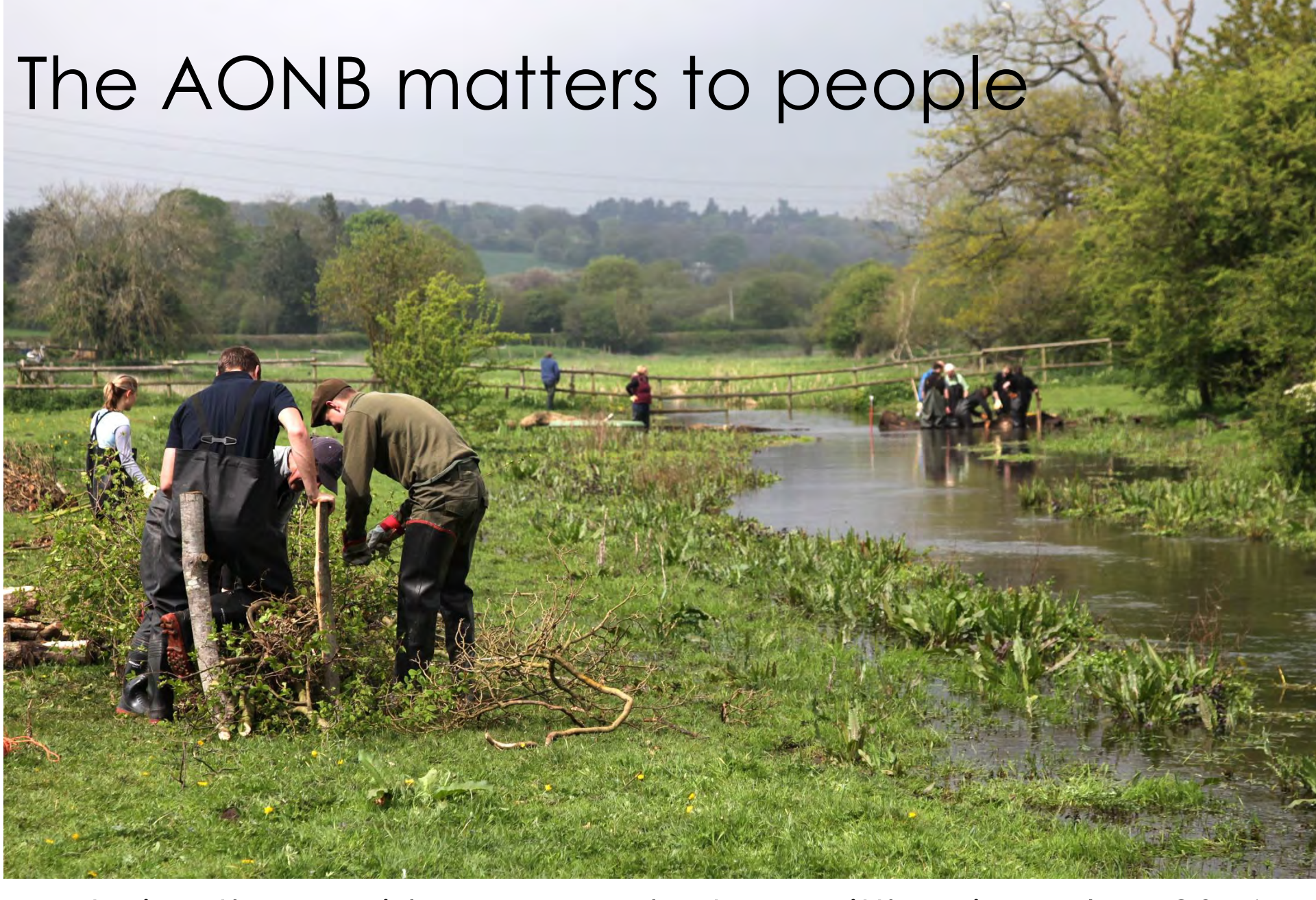
Restoring the R. Misbourne – volunteers, Little Missenden, 2014 A1190 (5) HOC/10043/0006