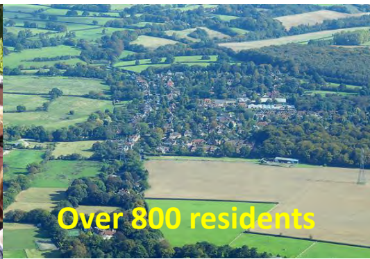
Over 800 residents