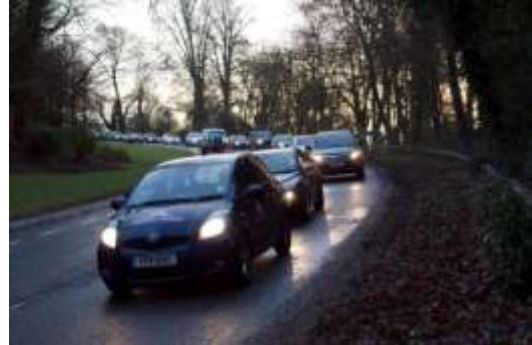
Morning peak congestion on the B485, approaching junction with A413