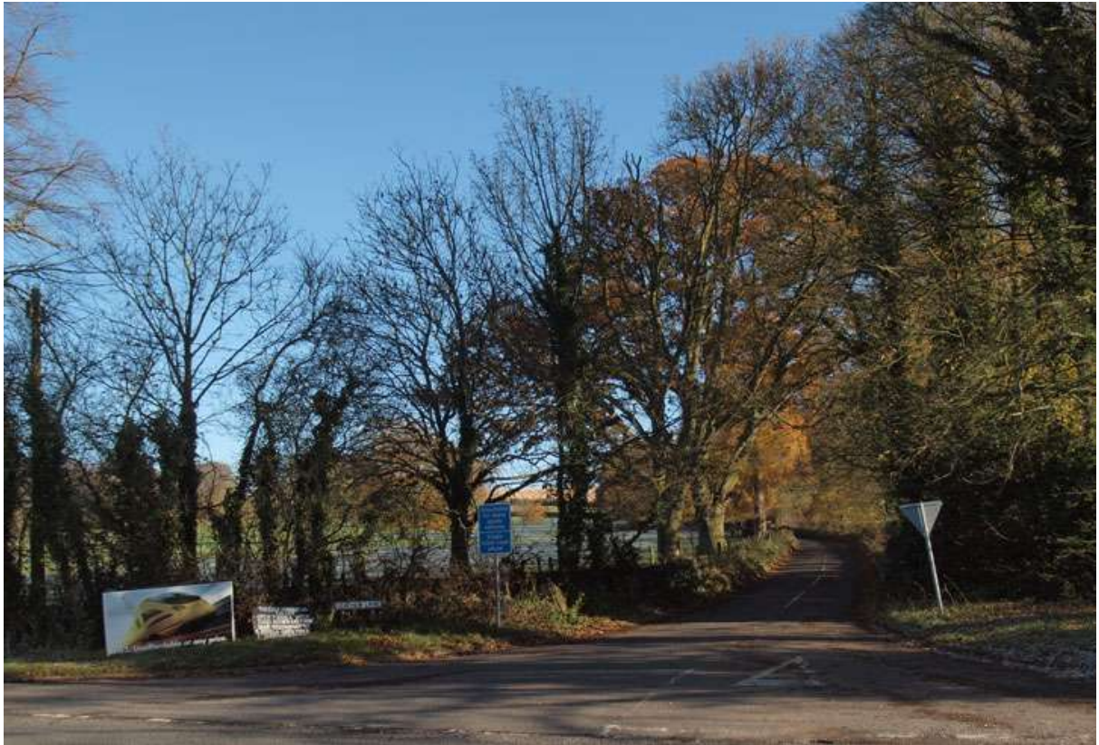
Leather Lane – Junction with A413

A response to the HS2 Environmental Statement, prepared by The Chesham Society