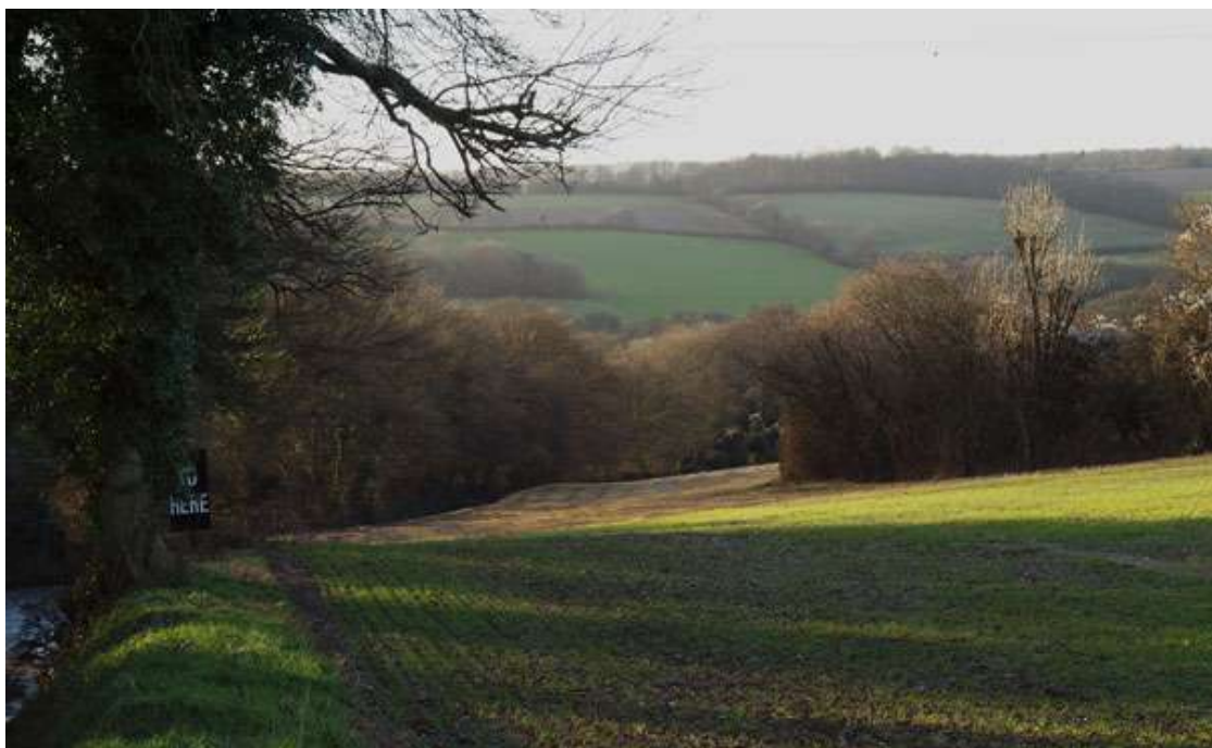
Leather Lane, showing the belt of trees to the south, and copse/chalk pit to the North

The society will support option B for the Leather Lane bridge.