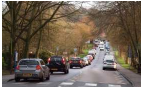
Morning peak congestion on the A4128 – Gt Missenden Link Road